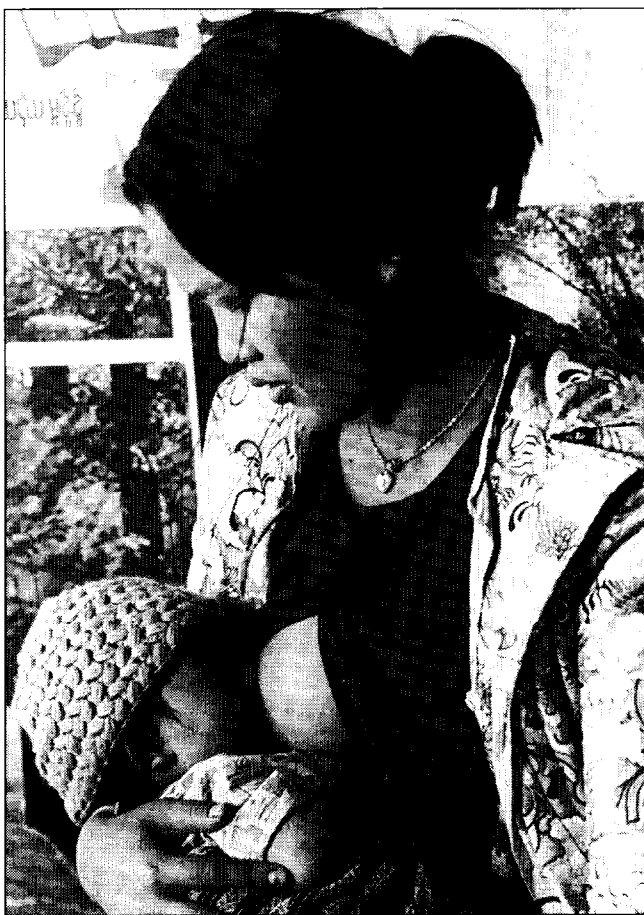
Studies have shown that breastfed babies are less likely to have persistent diarrhoea.

A relatively small proportion of children have many episodes of diarrhoea, and it is predominantly these children who develop persistent diarrhoea. This observation is supported by studies which show that a recent diarrhoeal illness is often associated with the occurrence of persistent diarrhoea. More studies are required to find out whether these high-risk children are in an environment where there is greater trans-