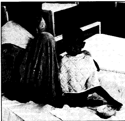
Children in Pakistan with persistent diarrhoea showed a significant improvement when fed on a traditional diet of khitchri .

In addition to the advantages of clinical efficacy and convenience, the potential financial benefits of a diet based on local foods are also great. The weekly cost of the soy formula (which is mostly imported) is about $14.00 for a 5kg child compared with only $2.00 for khitchri -yoghurt. The difference, when multiplied by the many episodes of persistent diarrhoea treated each year, could result in large financial savings for the whole country. These studies provide one example of a local diet using rice, lentils and yoghurt which can be successfully used for the dietary management of both acute and persistent diarrhoea.