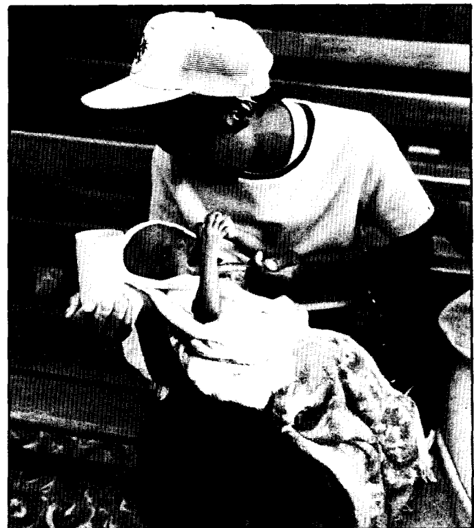
A Haitian mother gives ORS solution to her child.

salts more efficiently. ORT alone is an effective treatment for 90–95 per cent of patients suffering from acute watery diarrhoea, regardless of cause. This makes intravenous drip therapy unnecessary in all but the most severe cases.