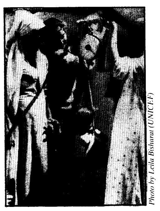
Child being weighed.

In addition to maternal education and surrounding environment, whether a child is male or female can determine survival rates. Within the same household, child care practices during diarrhoea vary according to the sex of the child. Among those children under three who had had severe diarrhoea during the two weeks preceding the survey, males were more likely to be taken to a doctor than females (44 per cent of