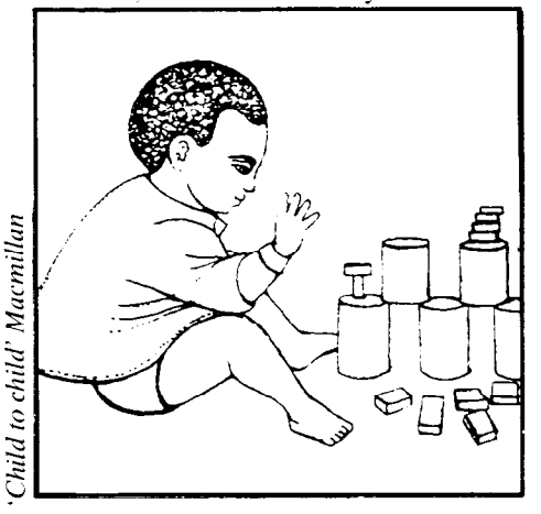
Toys can be made from simple everyday objects

Children admitted to hospital with diarrhoea have often stopped growing well. Most hospitals and clinics try to teach mothers about nutrition and hygiene, as well as providing a high energy diet. Some children, particularly those who are undernourished may also lack sufficient stimulation for mental development. Reasons for this are many. In poor families, mothers usually work for