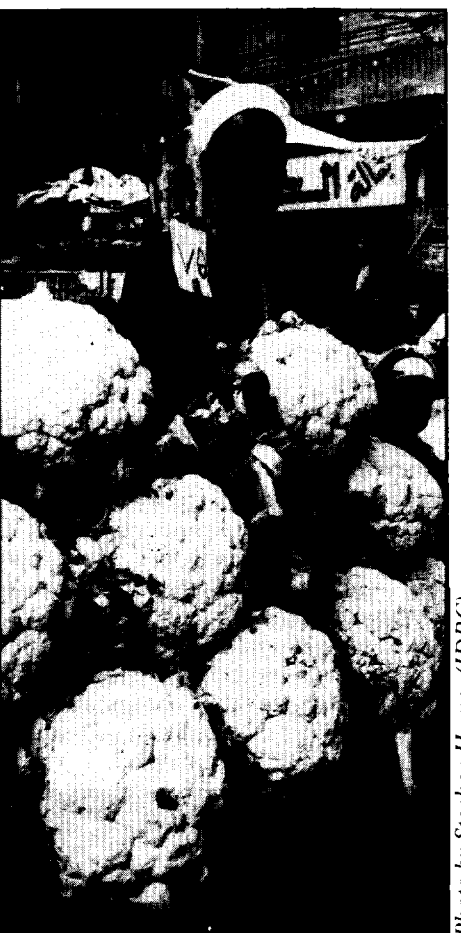
Vegetables eaten raw can be a source of amoebic cysts.

Unfortunately, potassium permanganate is of little or no use at all. The best measures to use are those recommended in DD27— soaking for 30 minutes in dilute hypochlorite solution or vinegar followed by rinsing in boiled water.