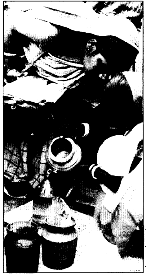
Surveys are a useful method of finding out whether mothers can correctly prepare oral rehydration solution.

As rice water was a widely accepted drink for children with diarrhoea, questions were asked about the frequency of cooking and lighting fires. Most respondents had fuel to make a fire, mostly wood or dung. While preparation of acceptable home solutions is possible, only 17 per cent were aware of sugar-salt solution, in spite of years of promotion through health education messages. In some southern areas, there was a higher level of awareness about sugar-salt solution