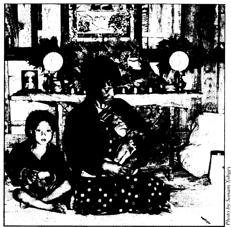
Breastfeeding protects against the dangers of infection.

After the age of 4-6 months, babies need more than just breastmilk, and weaning towards the normal family diet must begin. Weaning makes extra work and is a time of extra danger from infection and malnutrition. Weanling diarrhoea' is a well recognized problem (see DD6.). Breastfeeding protects against