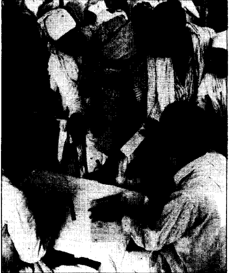
Preventing cholera. Inoculation before a religious fair in India. Latrines and piped water were also provided for the pilgrims.

pointed out that most cases of cholera caused by the El Tor biotype of the vibrio are mild, and that hospitalized cases constitute no more than 5 to 10 per cent of all diarrhoea cases in endemic areas, except at times of epidemics. Even then, they are treated