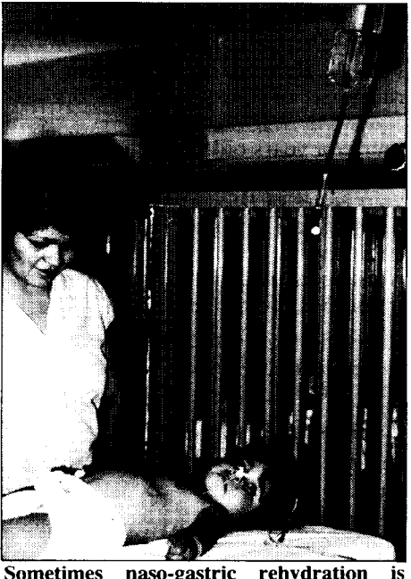
Sometimes naso-gastric rehydration i necessary.