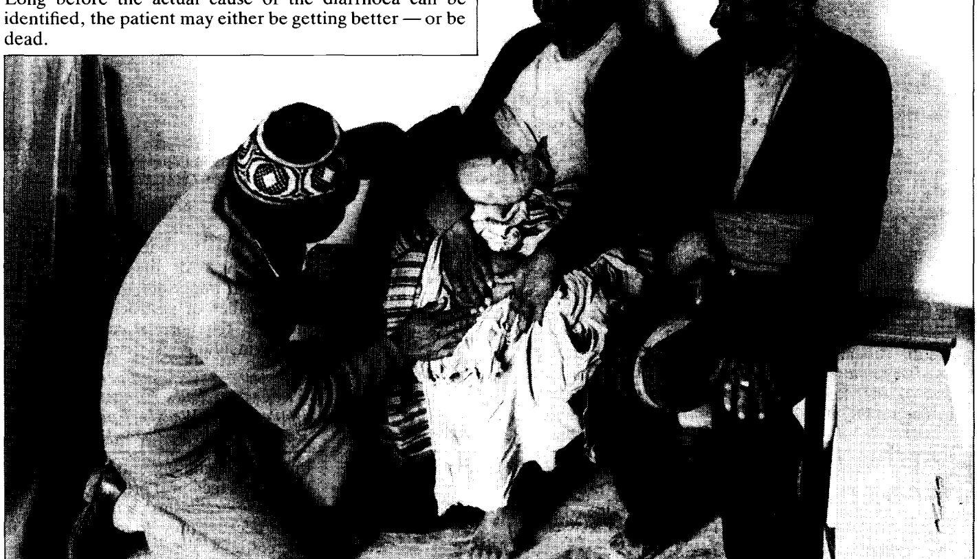
Diarrhoea CAUSE — AND EFFECT

Acute diarrhoea can cause life-threatening dehydration very quickly. Rehydration must start at once and primary health care workers need to make decisions about treatment based on signs, symptoms and their own experience. Long before the actual cause of the diarrhoea can be