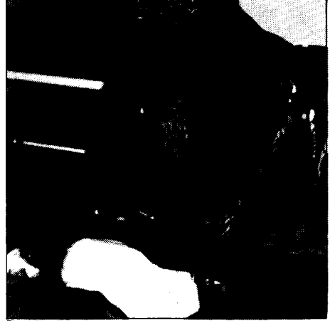
Replacing water and electrolyte losses.

assay — ELISA) which can be carried out without expensive equipment such as electron microscopes.