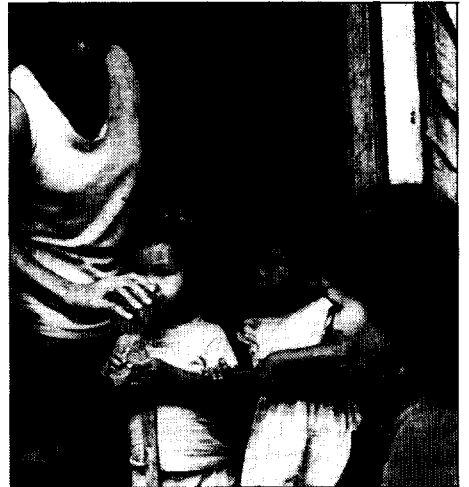
Giving oral rehydration at home: often, containers are a problem.

The shortage of one litre containers appears to be very common and one idea to help resolve it would be to make the oral rehydration packets with four sub-sections, each containing the correct amount of salts for a <sup>1</sup>/<sub>4</sub> litre