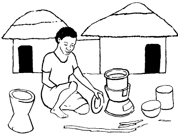
Kenyan ceramic jiko

Boiling Point is published three times a year by Intermediate Technology and contains regular updates about improved stove technology. A year's subscription costs £12; however a limited number of free subscriptions are available to people in developing countries. Write to: Intermediate Technology, 103-5 Southampton Row, London WC1B 4HH, UK.