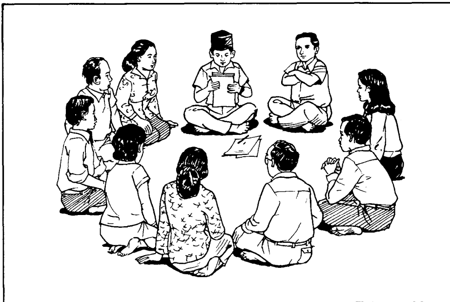
Health Care Together

The DD editors would like to say a belated but special thank you to the Voluntary Health Association of India for their help, VHAI not only widely publicised the poster competition in India, but also arranged for the many entries this publicity generated to be brought over to the UK. VHAI have also kindly offered to help with distribution of prizes within India. Many thanks also to the Hog Harbour primary school in Vanuatu, as well as to all other readers who collected posters for the competition. Finally, the editors would like to thank Air India for their generous assistance in transporting prizes to India.