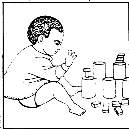
Child to child Macmillan

Children admitted to hospital with diarrhoea have often stopped growing well. Most hospitals and clinics try to teach mothers about nutrition and hygiene, as well as providing a high energy diet. Some children, particularly those who are under-nourished may also lack sufficient stimulation for mental development. Reasons for this are many. In poor families, mothers usually work for