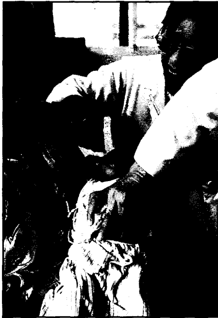
Learning the skills of oral rehydration therapy.

City, describing the previous day's experience in her presentation said: "The actual handling of cases is indeed a good way for us to acquire the knowledge and skills of clinical management of acute diarrhoea – the ORT way. For some of us, it has been a means of knowing what our mistakes in the field have been, for others, it has been a new experience to discover that ORT is not synonymous with ORS alone. And for some it has been an