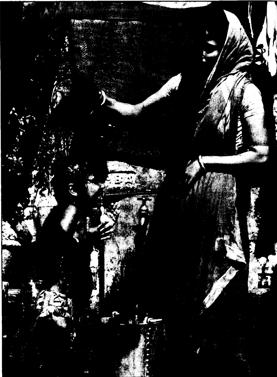
Improved child hygiene — one of the many benefits that accompany the provision of clean, accessible water supplies.