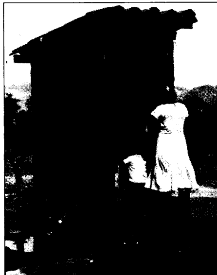
The defaecation and hygienic behaviour of children is crucial. Here, a mother in El Salvador takes her child to use the latrine.