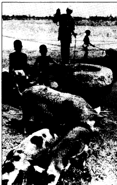
Pigs contaminate the pond surrounding an open, hand-dug well in Upper Volta. There is no drainage and the water in the well will be heavily polluted.

The fundamental question in diarrhoeal disease control is how may the diarrhoea pattern of a poor community be transformed to the pattern of a wealthy community? If this transformation requires the elimination of poverty and a substantial improvement in incomes and educational levels, then we should not talk of diarrhoeal disease control but focus instead on overall economic development and political change. However, there is some evidence that diarrhoeal disease transmission in poor communities can be reduced in the short term by improving water supply, excreta disposal and hygiene, prior to any reduction in poverty and deprivation in the longer term.