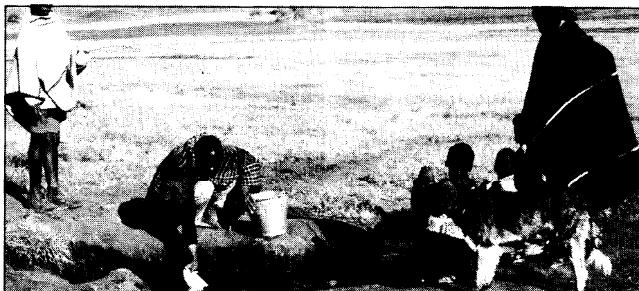
Collecting pond water in lowland Lesotho. This water source was heavily polluted, containing around 1000 E. coli per 100 millilitres.

The results of laboratory experiments are conflicting. Some have found a steady decline in the numbers of pathogens introduced into oral rehydration fluid. On the basis of these findings a WHO Scientific Working Group (2) concluded that " Escherichia coli , Vibrio cholerae , Salmonella and Shigella do not multiply in oral rehydration fluid and survive in declining numbers for up to 48 hours".