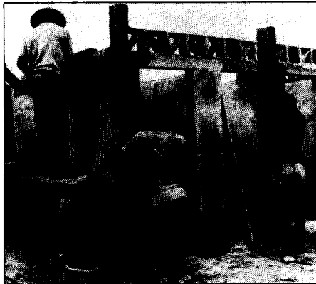
School latrines being built by villagers in Togo. As well as improving standards of hygiene, this project also has important educational value.

People have an opportunity to express their own needs through community participation. Their priorities may not be for water and sanitation. Governments and development agencies may have to respond to community priorities on the one hand, but also be prepared to provide health education to change community views and behaviour.