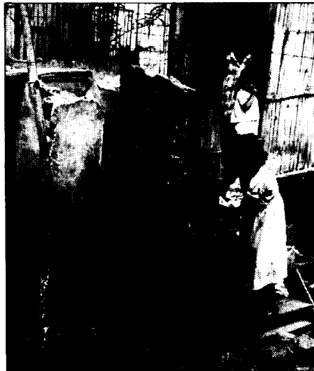
A typical scene in poor urban areas. People will not use squalid latrines like this one in Ecuador, but prefer instead to squat in an alley.

Children are not only the main sufferers from diarrhoea, they are also the main source of infection. Symptomatic and asymptomatic infection rates are